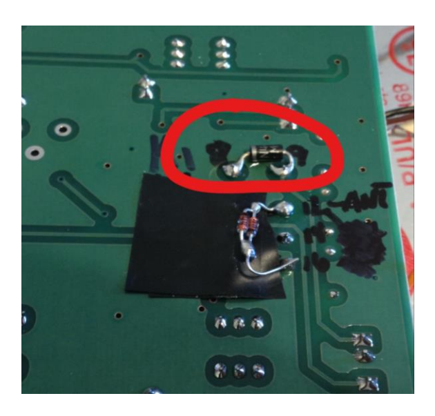
Figure 2: Reverse diode across relay K1. Use any silicon power diode, such as 1N4002 or 1N4007.

2. Relay Back-EMF protection. Diode D7 in the production run was misplaced and doesn't protect the relay switching device (be it a transistor, switch, opto-isolator) from the inductive back-emf of relay K1. Add a proper reverse diode across the coil of relay K1, pin 8 (cathode) to pin 9 (anode), as shown in Figure 2.