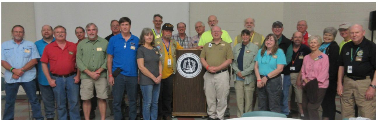
Some of the Survivors