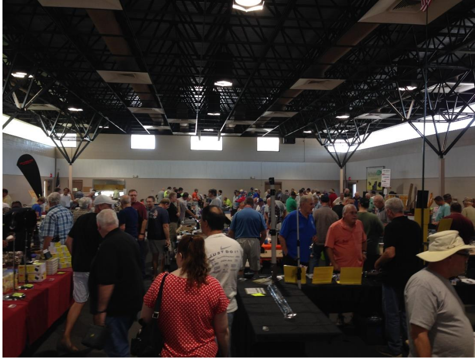
Milton Hamfest 2016

I had a blast at the Milton Hamfest! What a fine event! A good turnout, good weather (a bit hot, but the building was air conditioned), some of the best Hamfest food around. And what a warm welcome I got not only when I arrived, but the throughout the whole event. A rousing success!!