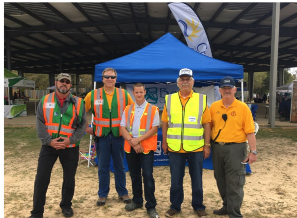
The 5 person team making the Triple B BBQ Cookoff work!