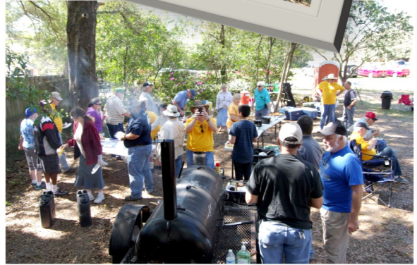
We had a great turnout for the NOARC picnic.