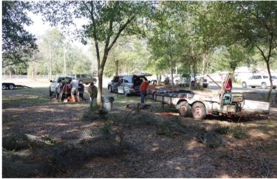
Club members near the end of their work.